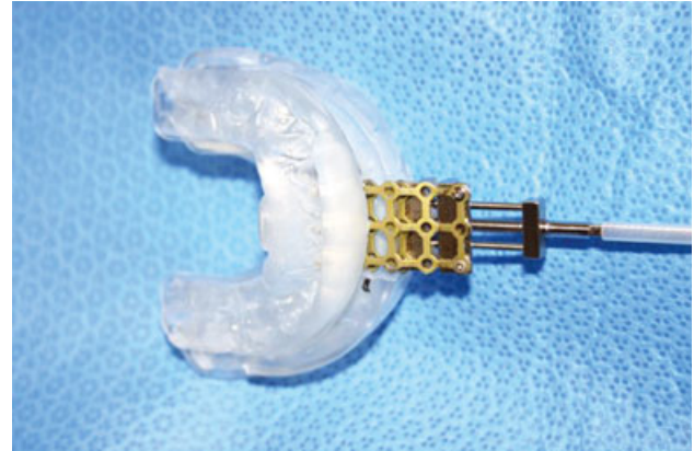
Fig. 2. View of the mandibular positioner showing the device used to modify and adjust the mandible–maxilla relation.

The coordination between nasal breathing and non-nutritive swallowing was evaluated in same subject under three different conditions in random order (Fig. 1). (i) neutral mandible position: lip closure and mouth closure, free anterior–posterior movement; (ii) mouth open position: the mandible was fixed with no