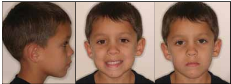
Fig. 6. A boy aged 5 years, 11 months, with adenoid facies.

The author has experienced success in alleviating sleep disorders and ADHD by using the diagnostic screening for mouth breathing and the multidisciplinary treatment protocol described in this article. Some of these patients have experienced improvements in their moods, growth and development, school grades, energy, and athletic performance as well as an alleviation