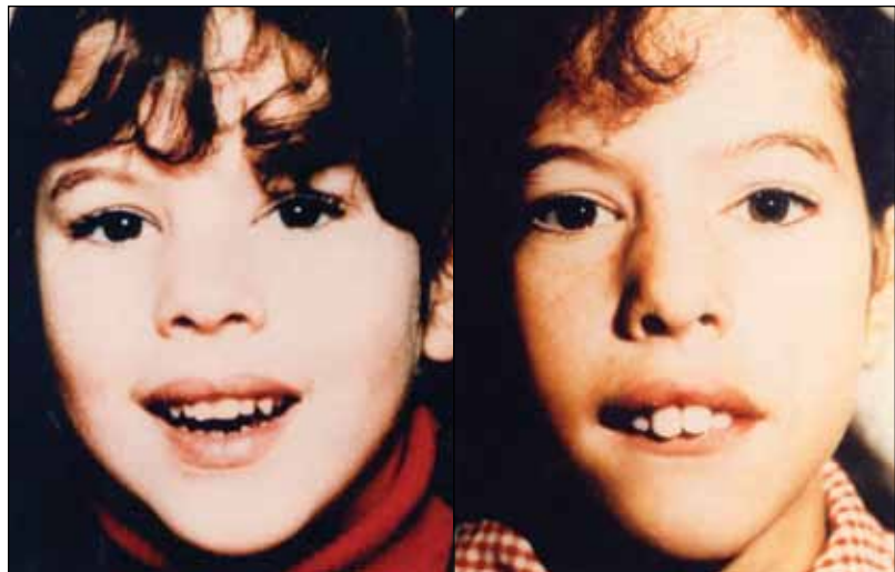
Fig. 1. Left: A 6-year-old girl who was a severe mouth breather. Right: The same patient at age 9, with abnormal facial growth and dental malocclusion.

Nasal respiration provides the most efficient mechanism for introducing