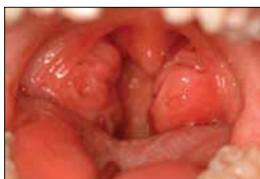
Fig. 5. An example of swollen tonsils, usually found in mouth breathers.

With surgical removal of swollen tonsils and adenoids, many of these children who were misdiagnosed with ADHD have shown marked improvement in behavior, attentiveness, energy level, academic performance, and growth and