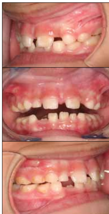
Fig. 11. An intraoral photograph of the patient in Figure 6, taken 19 months after the initial insertion, showing some anterior diastema due to slight overexpansion.

the maxillary and mandibular arches during Phase I removable appliance therapy (Fig. 9).