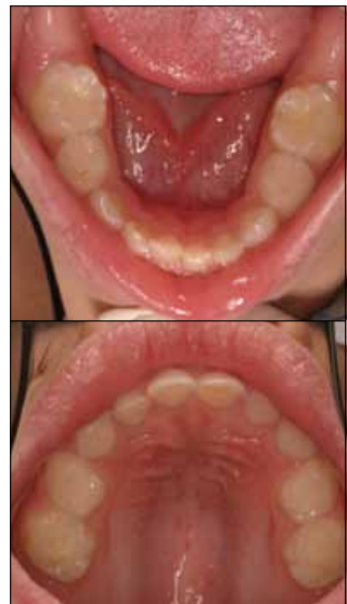
Fig. 8. An occlusal view of the patient in Figure 6. Note that the maxillary and mandibular arches are moderately narrow and the palatal vault is high.

of night time enuresis. No case has been more dramatic, however, than this one.