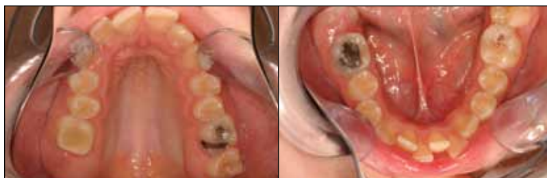
Fig. 4. An example of a child with a narrow palate, high palatal vault, and dental crowding due to mouth breathing.