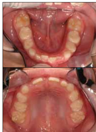
Fig. 12. The maxillary and mandibular arches of the patient in Figure 6, 19 months after the initial insertion.

Figures 10–12 show facial photographs (including intraoral dentition) taken after approximately two years of expansion therapy. The patient was slightly overexpanded