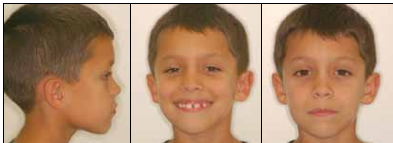
Fig. 10. The patient in Figure 6, 19 months after the start of Schwarz appliance therapy.

Since the patient had a moderately narrow palate and high palatal vault, palatal expansion was indicated. Maxillary and mandibular Schwarz appliances were used to expand both