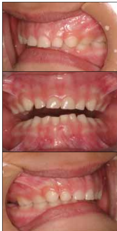
Fig. 7. An intraoral photograph of the patient in Figure 6.