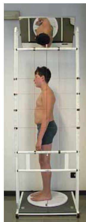
FIG. 2 Postural examination in lateral view: cervical hyperlordosis (increased cervical lordosis) with high dorsal kyphosis (dorsal kyphosis).