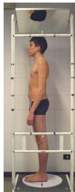
FIG. 5 Postural examination in lateral view: correction of the head and neck position 4 months after lingual frenectomy.

indicated for cases of ankyloglossia with functional impediment.