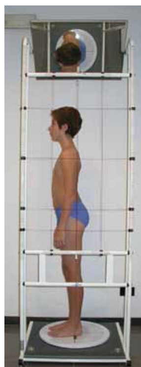
FIG. 1 Postural examination in lateral view: body posture leaning anteriorly with head and shoulders projected forward in relation to the buttocks (front scapulium) and body barycenter moved forward.

The frenectomy or frenotomy is a surgical procedure