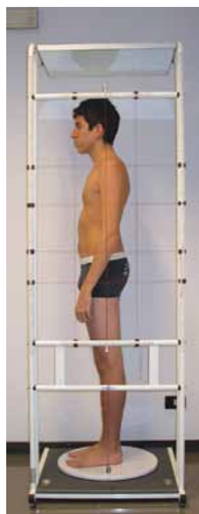
FIG. 4 Postural examination in lateral view: scapular plane in line with the gluteal plane (normal scapulum) but with the head propelled forward and straightening of the cervical area.