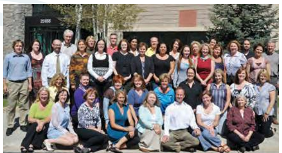
The ABMP staff