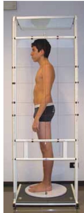
FIG. 4 Postural examination in lateral view: scapular plane in line with the gluteal plane (normal scapulum) but with the head propelled forward and straightening of the cervical area.