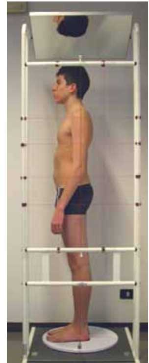
FIG. 5 Postural examination in lateral view: correction of the head and neck position 4 months after lingual frenectomy.

indicated for cases of ankyloglossia with functional impediment.